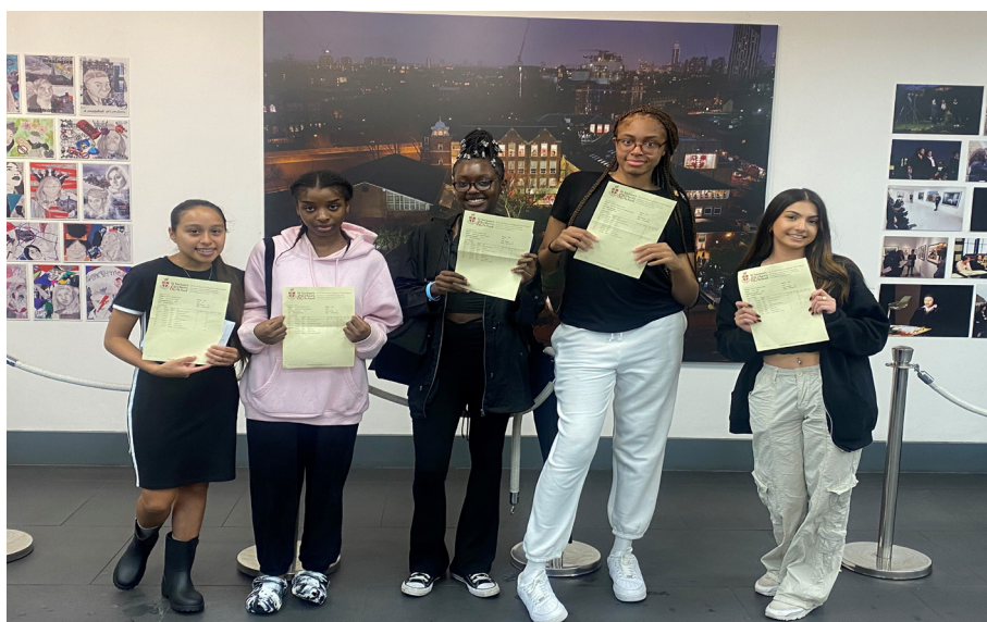
Our Year 11 Students celebrate results day (August 2022)