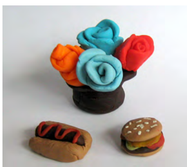
Well-being Week Offerings