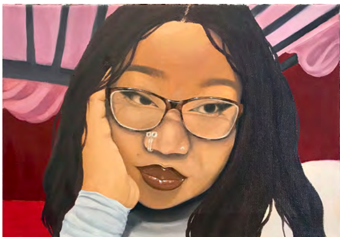
Willyn Dweh (12B) Oil on canvas