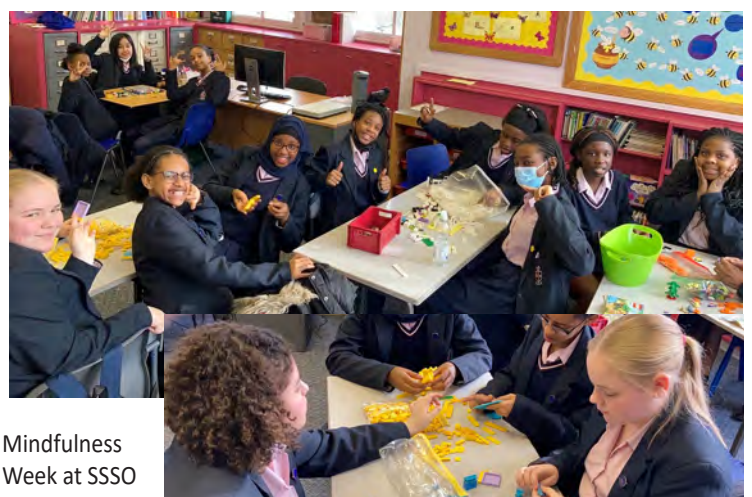
Mindfulness Week at SSSO