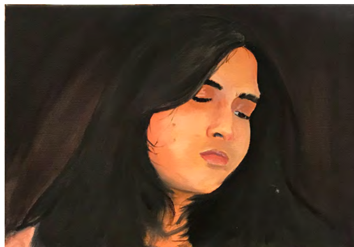
Meem Mahrou (12N) Oil on canvas